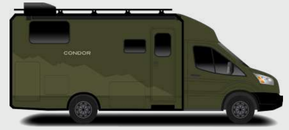
Conifer Full-Body Paint