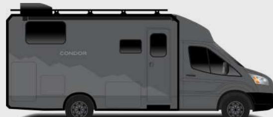
Magnet Full-Body Paint