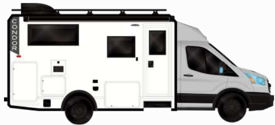
Graphics Delete Option