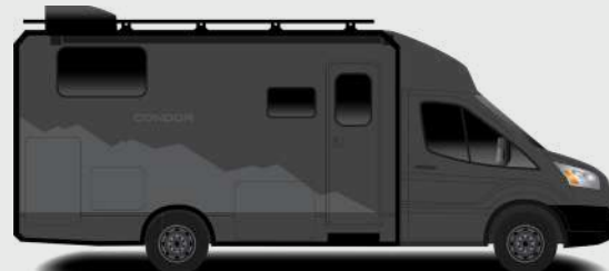
Black Hills Full-Body Paint