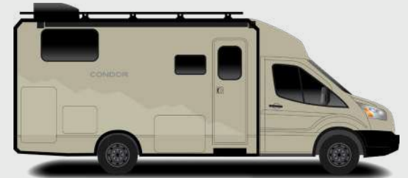
Sandy Oak Full-Body Paint